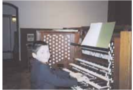
Looking at the Future of the organ

Myers Park Methodist Church. What we heard was a rather choppy sound that Bach did not intend.