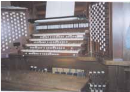
MP Methodist's Aeolian-Skinner

Before I left the church and while people were standing around and talking, the organ started to sound again rather loudly. The player turned out to be a ten year old boy playing paraphrases of familiar hymns. It was astonishing to hear someone so young making such good music at the console where he could just reach the Great with completely outstretched arms and barely get a